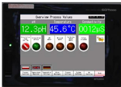
通过终端操作 触摸屏设置和监控槽参数（PRS 调控） Adjustment and monitoring of the bath parameters by the Touch screen operators' terminal (PRS control)