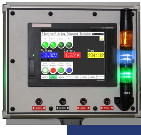
通过终端操作触摸屏调控3阶自动流程操作和预设电镀参数(DBS XXA-45 调控) 3-stage automatic process-run control and preset of the electro-plating parameters by the Touch screen operators' terminal