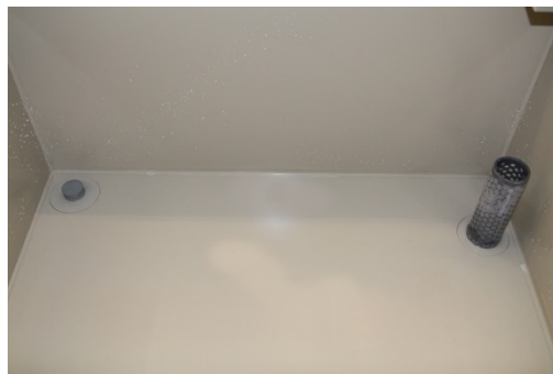
冲洗槽内视图 Inside view of rinsing tank